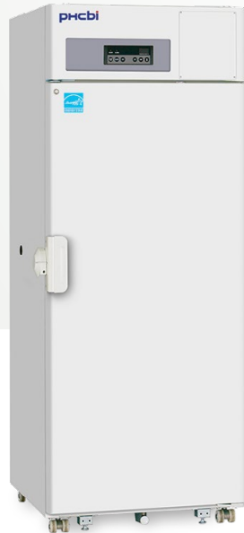
MDF-U731M-PA -30°C Manual Defrost Biomedical Freezer