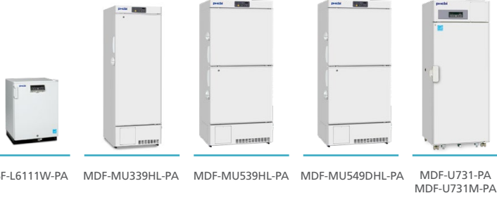
SF-L6111W-PA MDF-MU339HL-PA MDF-MU539HL-PA MDF-MU549DHL-PA MDF-U731-PA MDF-U731M-PA

High Performance -30°C and -40°C Biomedical Freezers