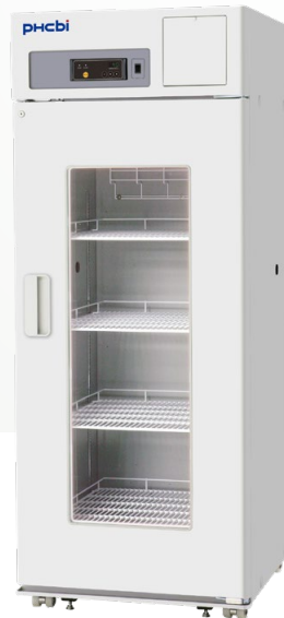
MPR-722-PA Pharmaceutical Refrigerator