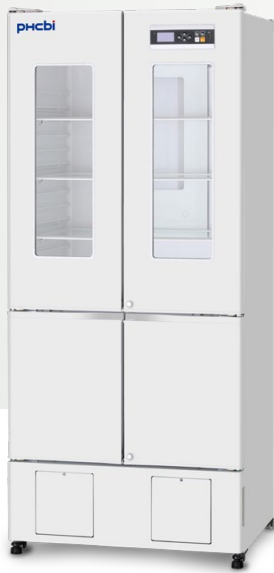
MPR-N450FH-PA Combo Refrigerator/Freezer