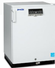
SR-L6111W-PA Undercounter Refrigerator

Storage temperatures specified on pharmaceutical product inserts are categorized as refrigerated or frozen. While frozen products typically tolerate a broader temperature environment, refrigerated products must be kept from freezing.